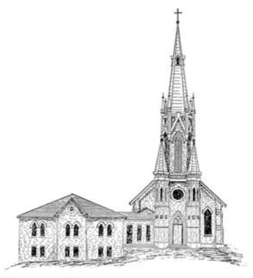
St. Mary of the Assumption Owen Sound

Email: smm@bmts.com www.stmarysandthemissions.ca